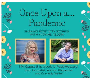
Paul Howard (aka Ross O'Carroll Kelly)

View a selection of interviews below and full series available on my You Tube Channel here .